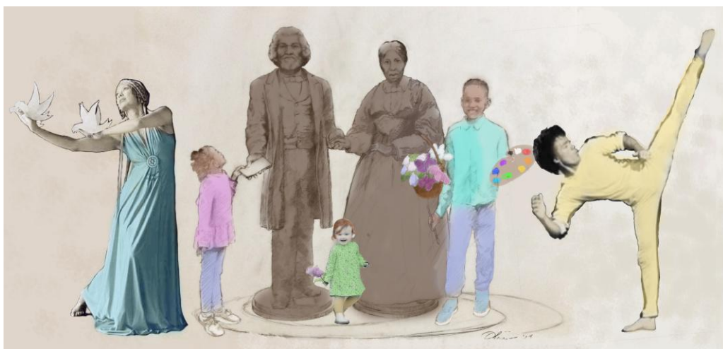
Preliminary Sketch of “Building Strong Children” statue:

To Learn more, visit: https://www.rctvmediacenter.org/frederickdouglass/